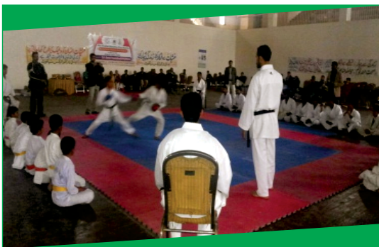
Martial Arts Competition at District Sports Complex Sialkot – 1st Mar