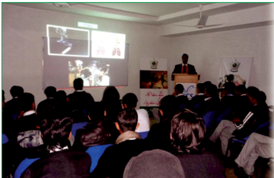
Lecture held at Excellence College of Sciences, Model Town Islamabad - 25th Feb