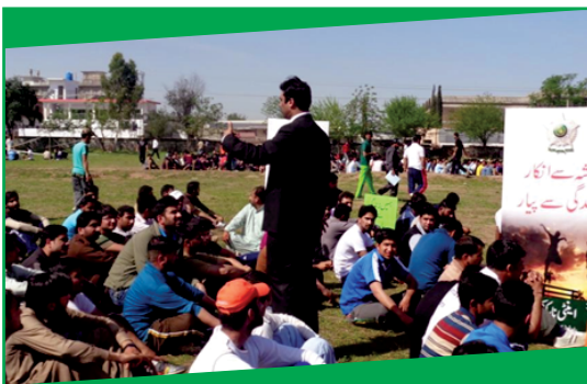
Lecture held at Model Town Islamabad -10th Mar