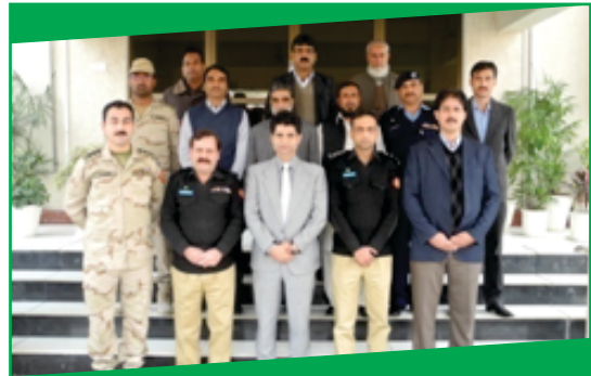
Financial Investigation Course 19-30 Jan 2015