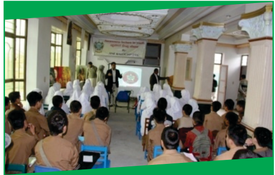
Lecture at Danish Model School Karani Road Quetta 17th Mar