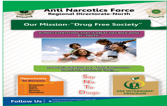
Flyers distribution of Youth Ambassadorship & Internship Program - 12th Feb