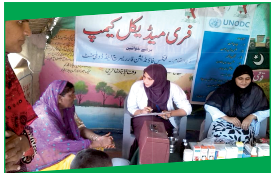
Medical Camp at Tallian Wala, Wasti Chowk Lahore – 4th to 9th Jan