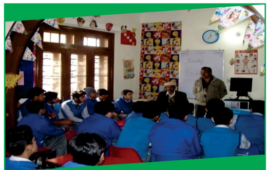
Awareness Lecture at Allied Public School 23rd Jan