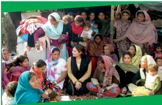
Awareness Lecture at Bagrian Pind Lahore – 2nd Jan