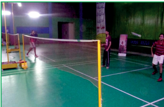
Badminton Match organized at Shehbaz Sharif Complex Rawalpindi – 24th Mar