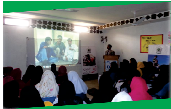
Lecture held at Excellence College of Sciences, Model Town Islamabad 26th Feb