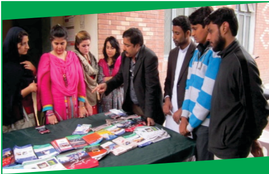
Awareness / Exhibition Stall at Garhi Shahu Lahore -3rd Mar