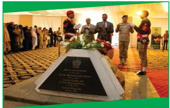
ANF Raising Day - 21st Feb