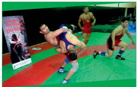
Wrestling Match organized at Islamabad -11th Mar