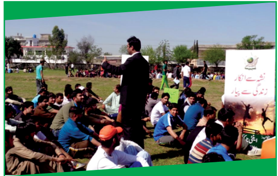
Lecture held at Model Town Islamabad -10th Mar