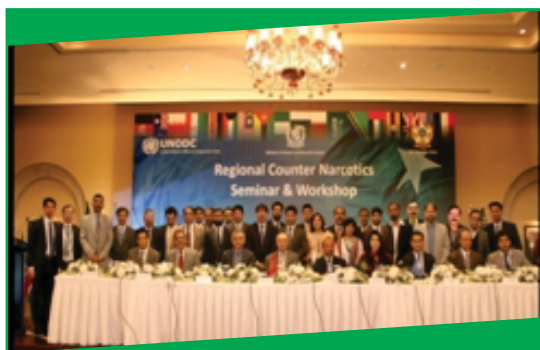
Basic Counter Narcotics Drug Law Enforcement Course-I 19 Jan-13 Feb 2015

Anti Narcotics Force (ANF) Pakistan, in collaboration with United Nations Office on Drugs and Crime (UNODC) Country Office Pakistan, organized a seminar on 27th January 2015 and a workshop on 28th January 2015 at Serena Hotel Islamabad, to synergize efforts of regional countries in combating the emerging challenges posed by narcotics trafficking. The seminar was thus structured as a deliberative exercise amongst experts, supplementing the inter-governmental track. The seminar was attended by 450 x persons including Federal / Provincial Ministries / Govt Depts, Army Officers Ex ANF DGs / Dirs / FCs, IATF members/ LEAs, IG Jail Khana Jat, Anchors / Media Persons, Social Workers/ Opinion Makers, Celebrities, UNODC Staff, DLOs, Ambassadors / High Commissioners in Pakistan, NGOs, UN / Intl Orgs in Islamabad, Scholars / Researchers / Think Tank, Civil Society members, University / Colleges Teachers / Students, Members of Senate / National Assy Standing Committee on Interior & Narcotics Control, Ex Secys NCD and Speakers etc.