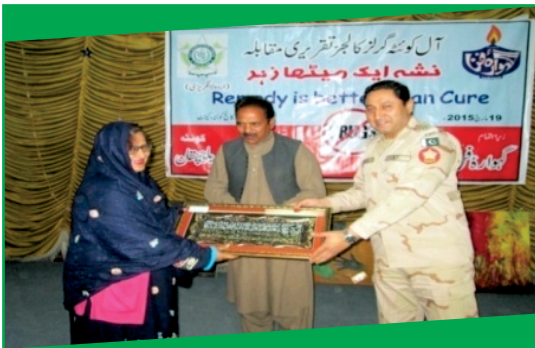
Seminar cum Speech Competition held at Govt. girls Degree College Quetta Cantt – 19th Mar