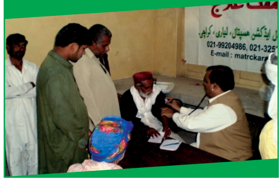
Medical Camp at (Muhalla Nazar Wala) – 3rd Mar