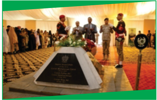
Annual Raising Day 21 Feb 2015