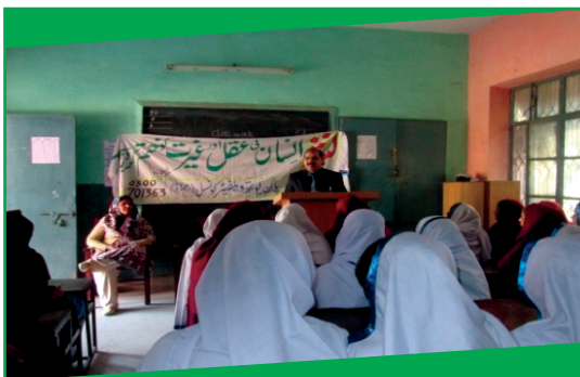
Awareness Lecture at Govt. Chirag Girls High School Beghum Pura Lahore 24th Jan