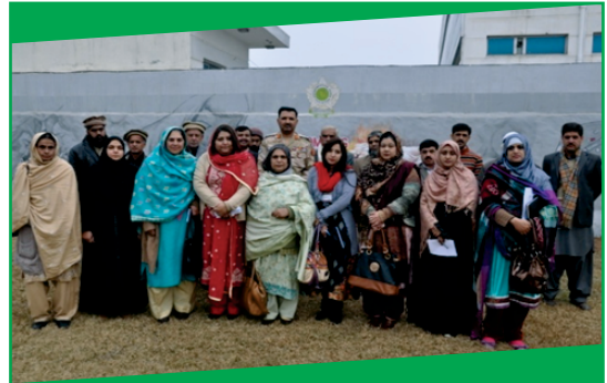
Awareness Session held at RD-North - 21st Jan