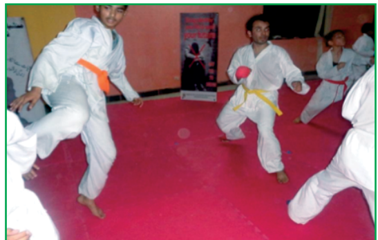
Karate Match organized at Shehbaz Shareef Complex Rawalpindi - 27th Mar