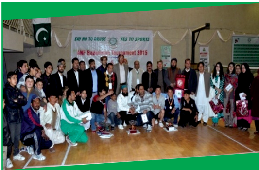
Badminton Tournament at Govt General Muhammad Musa College Quetta - 26 Feb