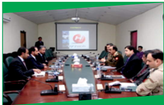
Delegation of Hi-Tech 09 Feb 2015