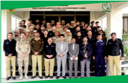
Basic Counter Narcotics Drug Law Enforcement Course-I 19 Jan-13 Feb 2015