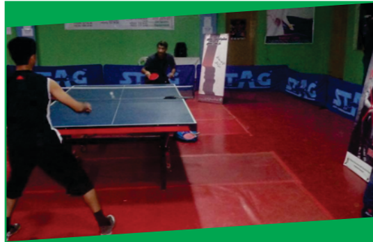
Table Tennis organized at Shehbaz Shareef Complex Rawalpindi - 31st Mar