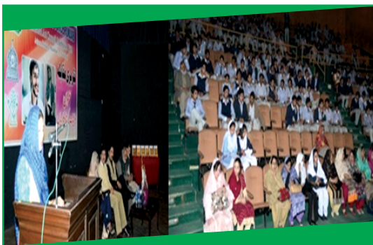
Speech Competition in Faisalabad - 12 Feb