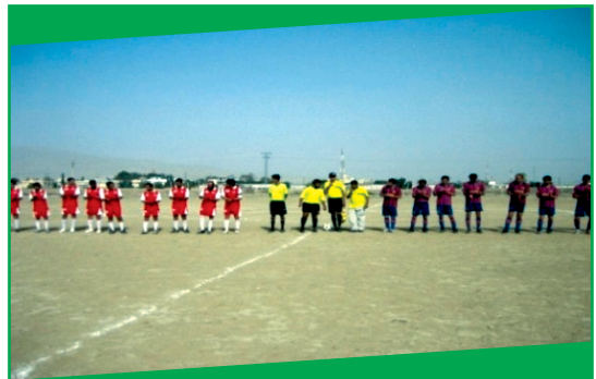
Football Tournament Yezdan Khan High School Gulistan Road Quetta – 23rd – 31st Mar