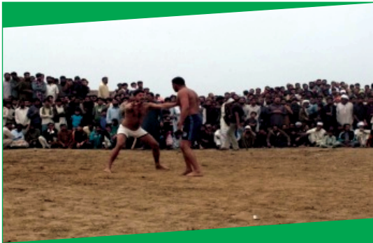
Punjabi Khed Mela /Sport Event in Ilyas Colony Gujranwala - 22nd - 23rd Feb