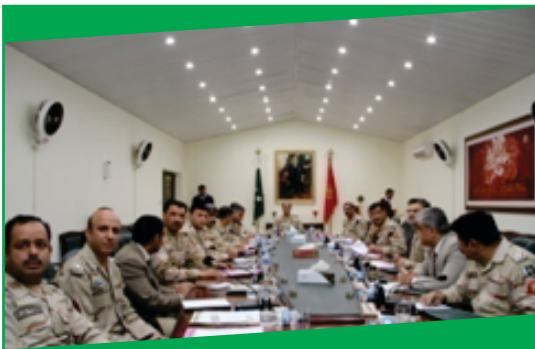
4th Force Commander Conference 23 Feb 2015