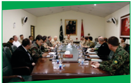
Defence Attaché 03 Mar 2015