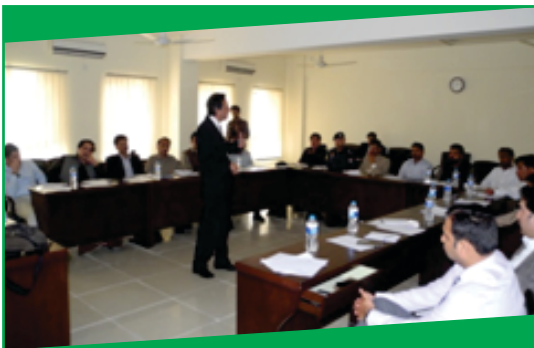
Improvised Explosive Devices (IEDs) Training (UNODC) 24-27 Mar 2015