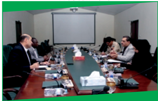
Display/painting of awareness wall