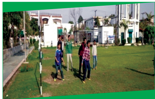
Foot ball Tournament at Canal Bank New Campus Lahore – 3rd – 10th Mar