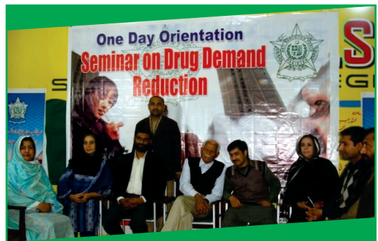
Seminar at Peshawar – 24th Feb