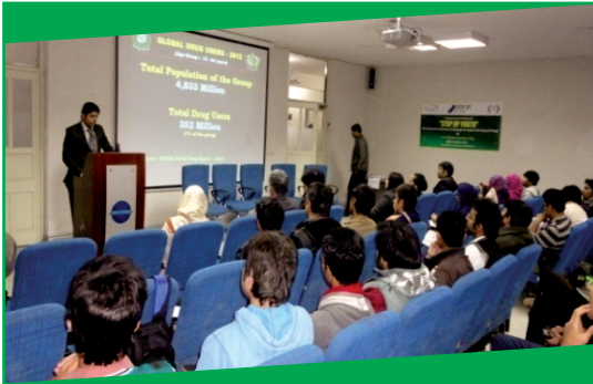
Lecture at Pakistan Finance College Lahore – 12th Mar