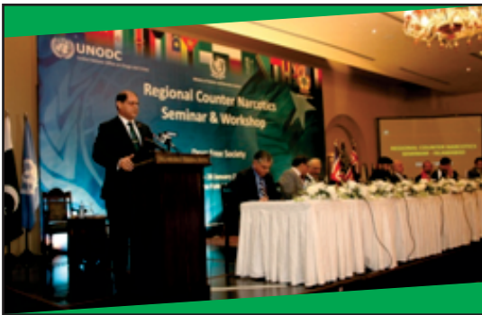
Regional Counter Narcotics Seminar & Workshop – 27 Jan 2015