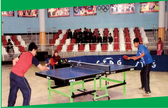
Table Tennis Tournament at Peshawar – 3rd -5th Mar